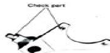
Fig. 6-2-32 Checking gear shifting fork end

If the gear shifting fork should be burnt or worn on its contact surface to the gear. Replace with new one. Besides check the gear for burning and scratch. If faulty, replace.