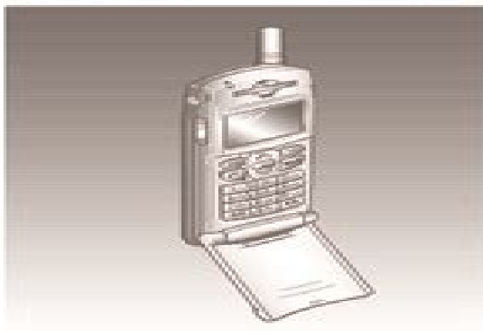
DUAL BAND Mobile Cellular Phone