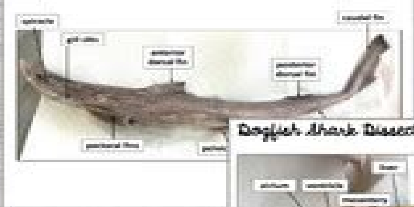
English Shark Dissection - External