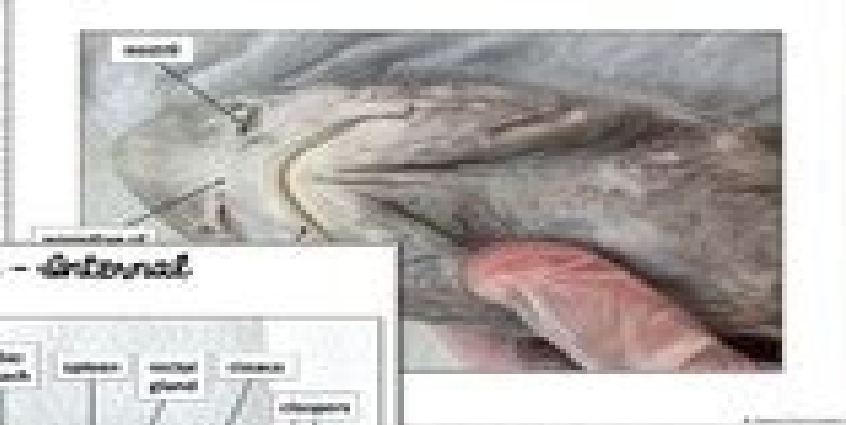
English Mark Dissection - Internal