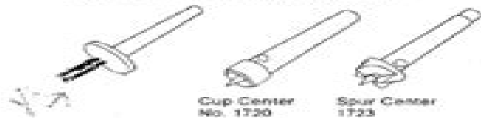
Cup Center No. 1720

The spur and cup centers are shipped as original equipment. Replacements are available. A screw center is used in headstock for work which must be held more securely and for small block turning. The live center is used in the tailstock in place of cup center. This center has a ball bearing and turns work smoother and easier than non-revolving cup center.