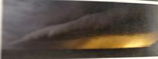
The weathered roll clouds can move ahead of big storms that are brewing.

There is a long, low tube of cloud, which can appear twisted behind from horizon to horizon. Sometimes a roll cloud has two more air surfaces. At other times, it can appear quite rough and lumpy. Roll clouds move at speeds of up to 15 mph, with the tube appearing twisted as it rolls along. The direction of rotation is not as it would be for a storm rolling along the ground. In fact, the roll cloud tends to approach in a spiral—the cloud surface lifting at the front and dropping down to the rear.