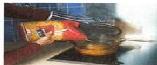
C – Some of the evaporated water has turned back into a liquid on the lid of the pan. The water vapour condenses back to water.