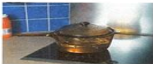
B – The water boils and some of it evaporates and turns into water vapour.