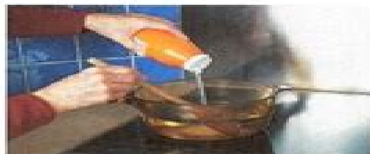
A – Salt is added and stirred.

The photographs show the first steps in cooking some pasta.