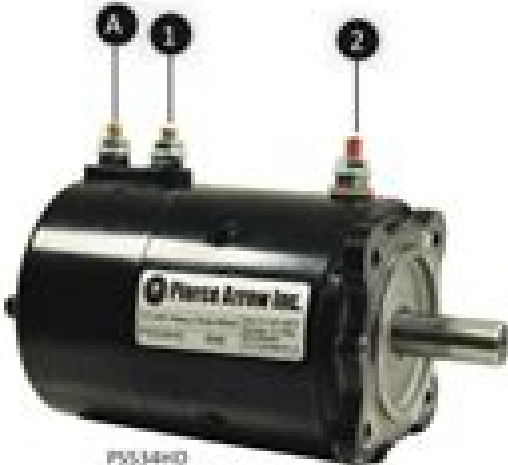
PSS34HD Prestolite 12V Motor

Use the Pierce PSS34H or PSS34HD Motor on the PSS28C round solenoid assembly.