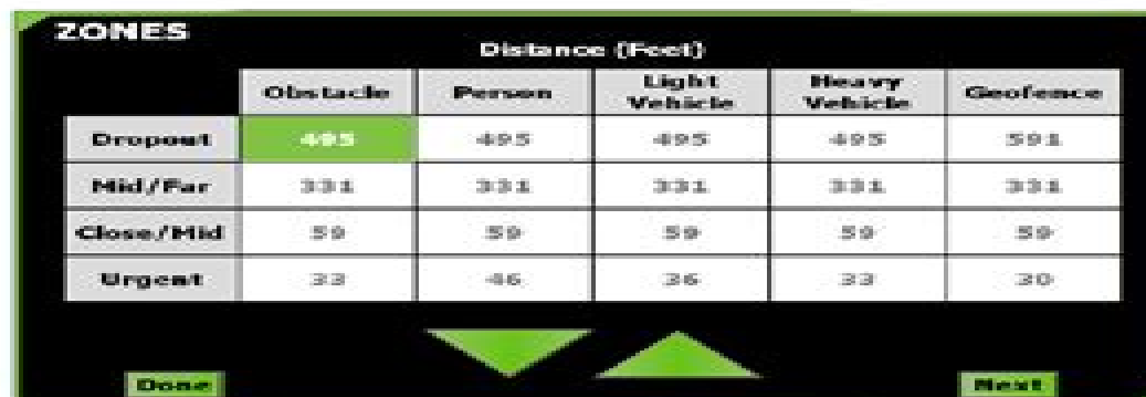
Figure 8: Zones menu screen