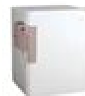
Pyxis® SMART Remote Manager (refrigerator not included)