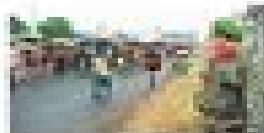
Refugees in Rwanda

Following the genocide, there were widespread incidents of rape, torture, and destruction of property. The genocide was a result of a long history of discrimination and violence against the Tutsi.