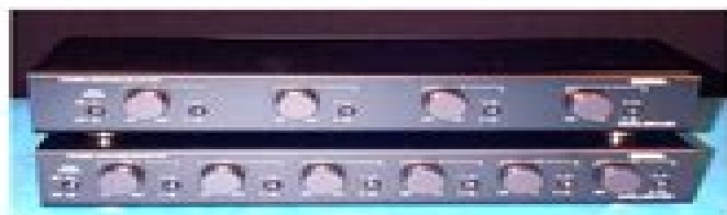
SSW-L4EX (top) and L6EX (bottom)

Music sets the mood, you choose the location. Sima's family of speaker selectors gives you the ability to feed audio in up to six remote locations. Bathroom, bedroom, family room or patio; tune in anywhere in the home.