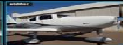
2013 Cessna 400 Corvallis TTx With Intrinsic Flight Deck & G2000 All Glass Cockpit! Speed, Comfort, Safety & Style! Secure Your SN Now. $733,950