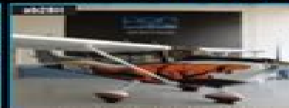
2013 Cessna Turbo 182T 16 TT, XM Weather, Stormscope, Custom Paint, Barrett Jackson Edition - One of a Kind! $499,000