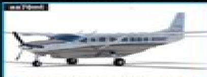
2013 Cessna Grand Caravan EX 867 SHP PT6-140 w/ Improved Lighting, Interior & More. West Coast's Only New Caravan ASR! $2,149,000 Base

Pacific Air Center is your CESSNA Factory Authorized Dealer See Our Quality Pre-Owned Inventory At www.pacaircenter.com