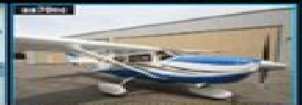
2006 Cessna Turbo 306H Stationair 280 TT, Like New, Low Time, Excellent Condition, G1000, VGR, Always Hangared. $399,000