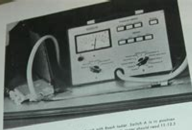
Checking the voltage supply to control unit with break tester. Switch A is in position measuring. With switch B in position voltage 1 or voltage 0, meter should read 12-12.5 or 0.

Resistance of primary windings of pressure sensor Resistance of secondary windings of pressure sensor Resistance of trigger contacts of group Resistance of trigger contacts of group Operation of mixture enrichment Resistance of contacts in throttle valve switch Resistance of contacts in throttle valve switch Resistance of temperature sensor Resistance of temperature sensor Measuring resistance of motor windings and cables