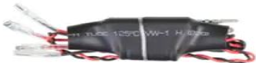
2x FWK W