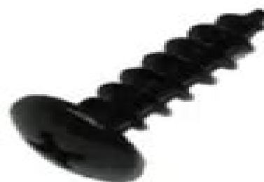
16 x SCREW