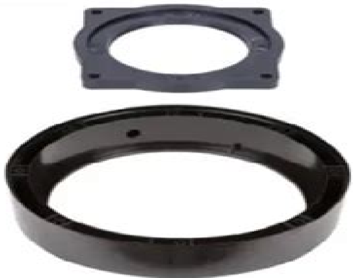
2x LSR 80 GOLF 5 + 2x LSR GOLF 5