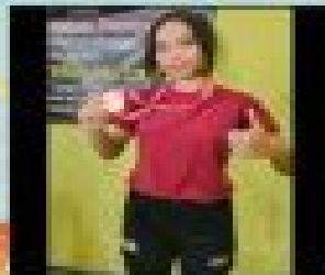
Juara 3 Cabor Senam Lantai