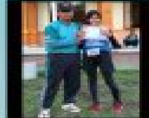
Juara 2 Lompat Jangkit Putri