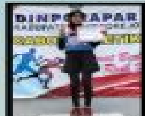
Juara 1 Lari 1500 m Putri