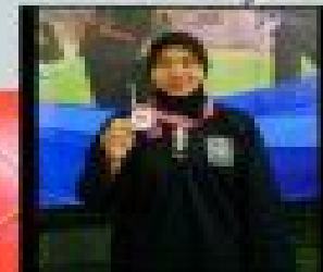
Juara 2 Cabor Pencak Silat Kelas F