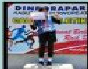
Juara 2 Lari 100 m Putri