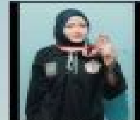
Juara 3 Pencak Silat Kategori Seni Tunggal