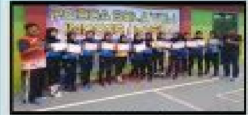
Juara 3 Voli Indor Putri