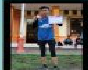
Juara 2 Lompat Jauh Putra