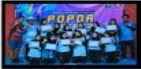
Juara 3 Handball Putri