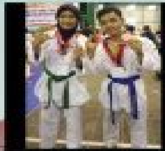
Cabor Taekwondo Juara 2 under 59 dan Juara 3 under 55