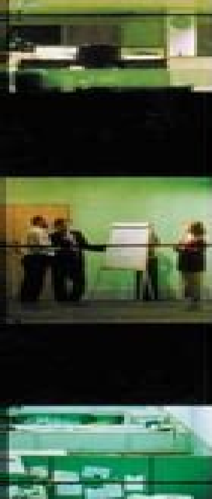
Monitor status screen