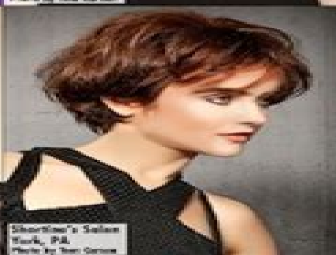
Shortline's Salon York, PA