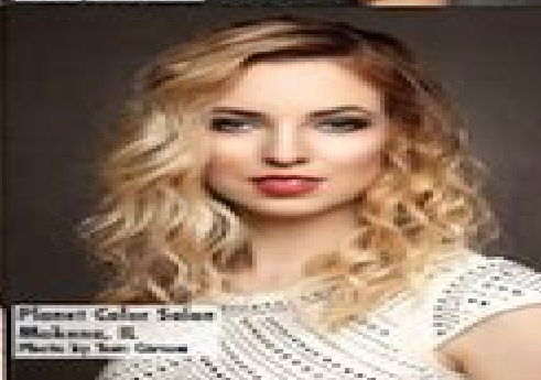
Planet Color Salon Mukwonago, IL