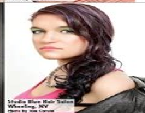
Studio Blue Hair Salon Wheeling, WV