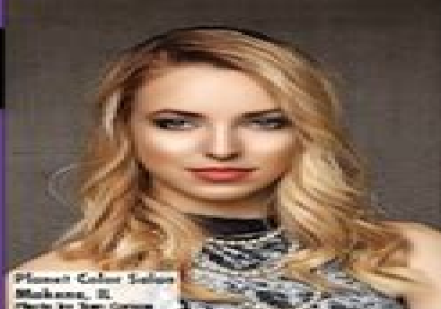
Planet Color Salon Mukwonago, IL