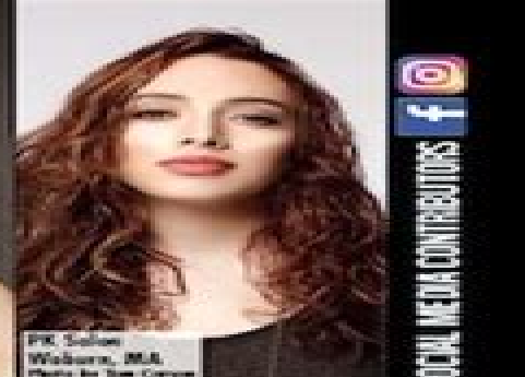
PK Salon Woburn, MA