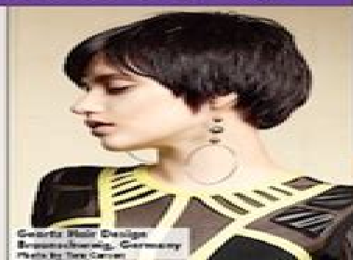
Geertz Hair Design Braunschweig, Germany