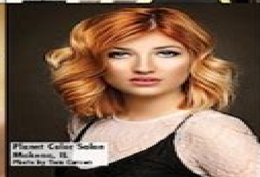
Planet Color Salon Mukwonago, IL