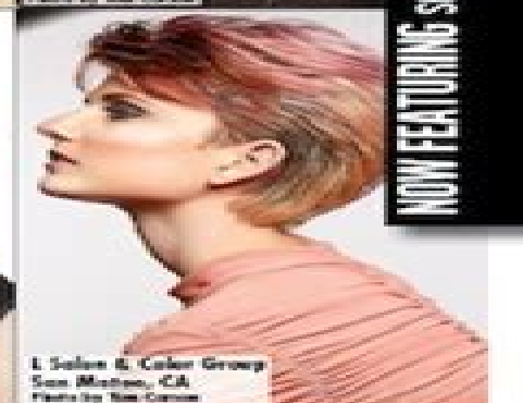
L Salon & Color Group San Mateo, CA