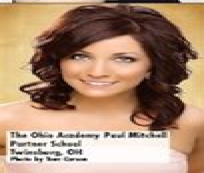
The Ohio Academy Paul Mitchell Porter School Swinsburg, OH