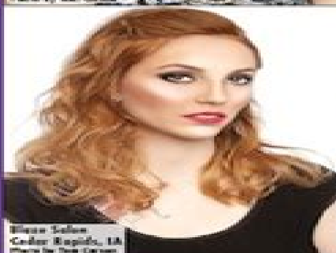
Blaze Salon Cedar Rapids, IA