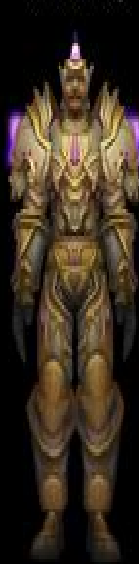
TIER 4 JUSTICAR