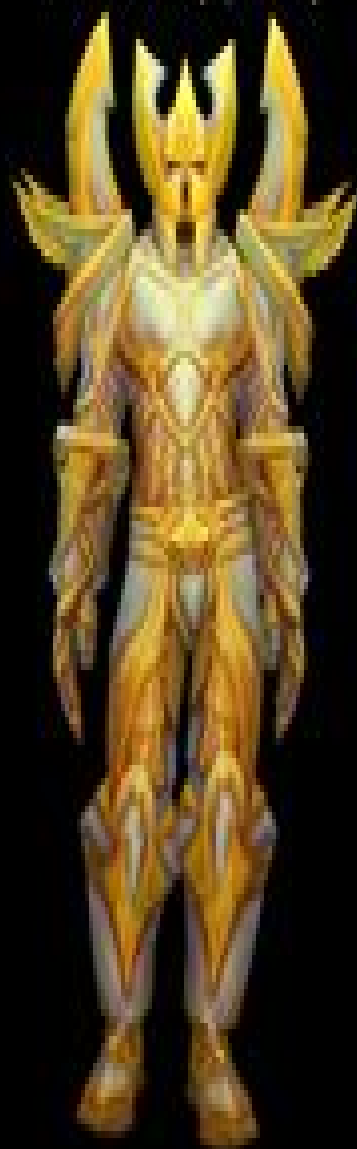
TIER 1 LAWBRINGER