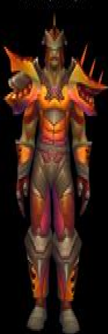
TIER 2.5 AVENGER'S