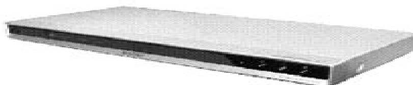
Photo : DVP-NS38/NS39/NS47P/NS57P