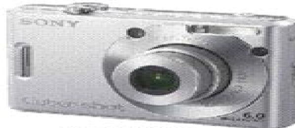
Photo : DSC-W30/Silver.