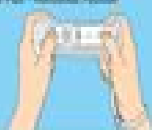
Wii Remote Plus – Horizontal Position