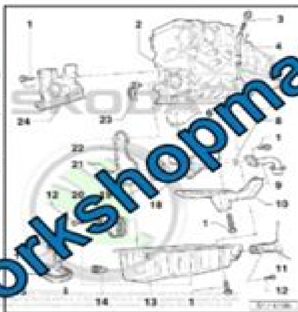
1. Removing and installing parts of the lubrication system 101