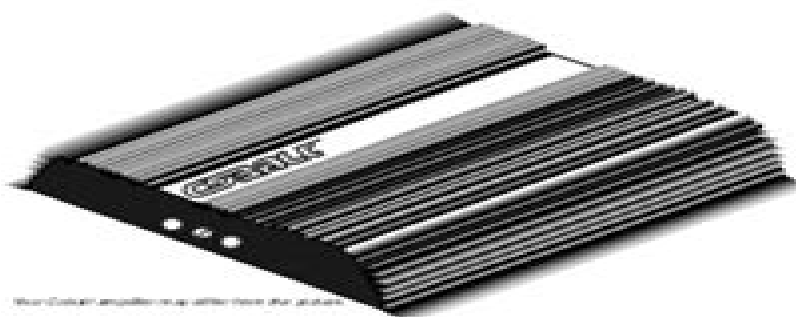
Most Cobalt amplifiers up offer four channel power.

There are 2 types of crossovers on Cobalt amplifiers. The first is a 100hz fixed high pass or low pass. The second is a fully variable high pass or low pass crossover that is adjustable from 45hz to 5Khz. Both use a slope of 12dB per octave. The chart below shows the type of crossover your amp uses.