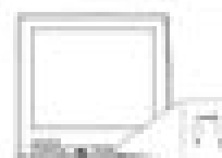
(Example of a TV)