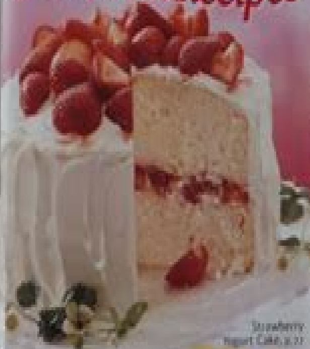
Strawberry Yogurt Cake, p. 27