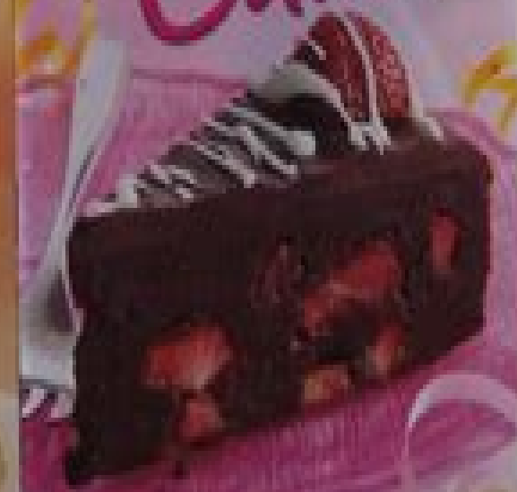
Fudge Layer's Strawberry Frosting Cake p. 27

More than 40 NEW FAVORITES from a cake mix