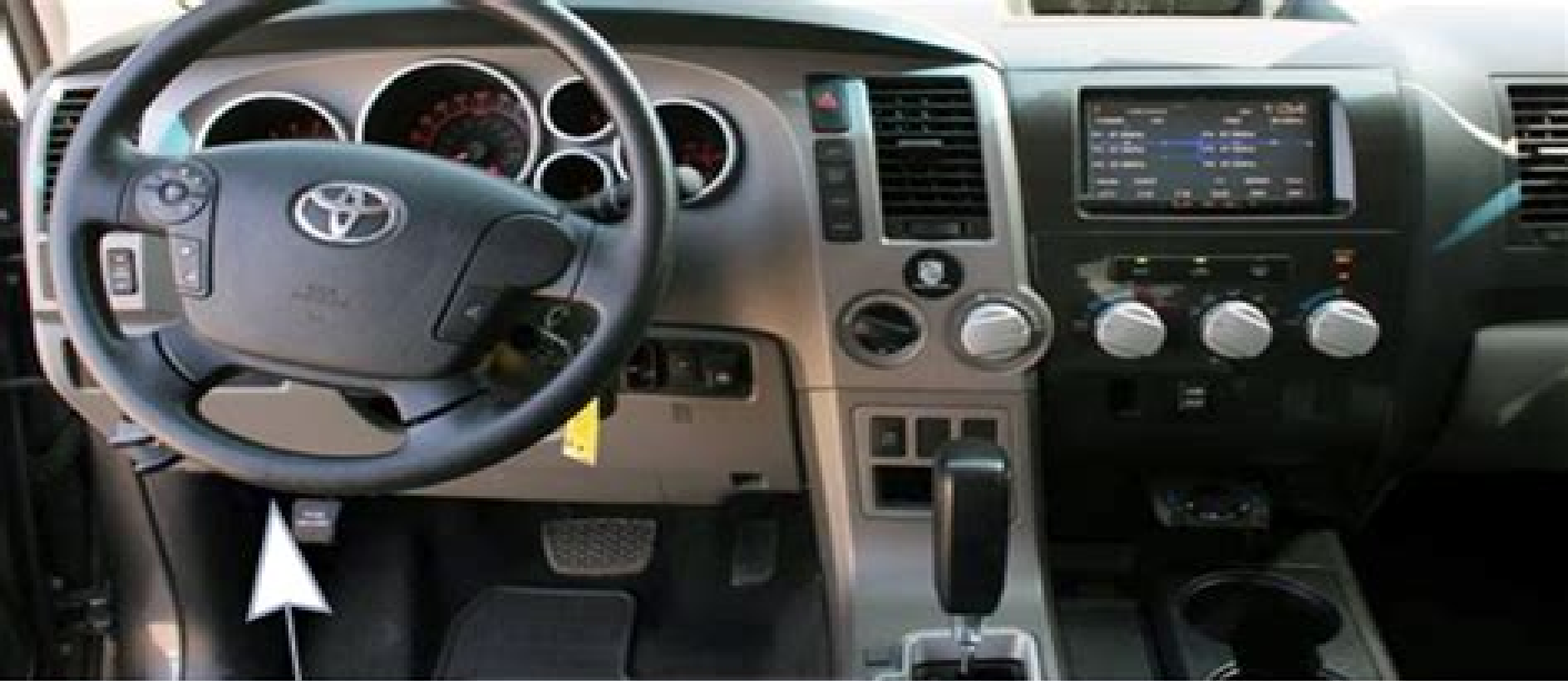
Instrument Panel Fuse Box