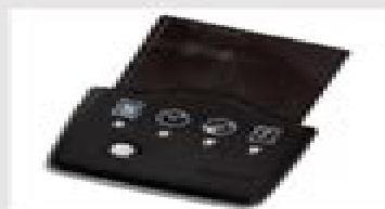
MiniLink to be purchased separately