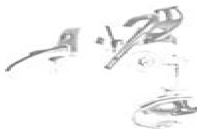
Chain saw on assembly stand

Servicing and repairs are made considerably easier if the saw is mounted on assembly stand 5910 850 3100 or 5910 890 3100. This enables the saw to be swivelled to the best position for the ongoing repair and thus leaves both hands free.