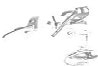
Chain saw on assembly stand

Servicing and repairs are made considerably easier if the saw is mounted on assembly stand 5910 850 3100 or 5910 890 3100. This enables the saw to be swivelled to the best position for the ongoing repair and thus leaves both hands free.