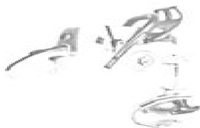
Chain saw on assembly stand

Servicing and repairs are made considerably easier if the saw is mounted on assembly stand 5910 850 3100 or 5910 890 3100. This enables the saw to be swivelled to the best position for the ongoing repair and thus leaves both hands free.