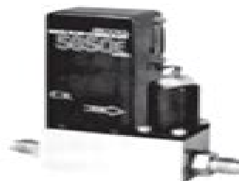
Model 5850E Mass Flow Controller with D-Connector