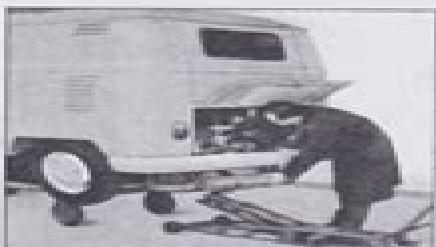
Engine Removal and Installation. Section M, Engine and Clutch