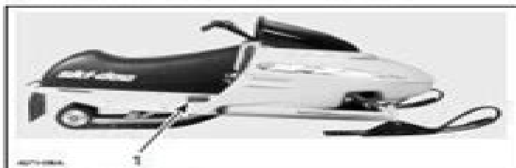
1. Vehicle serial number