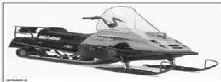
TYPICAL — TUNDRA R

Skandic LT Skandic LT E Skandic WT Skandic SWT Skandic WT LC Skandic SUV