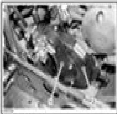
1. 4 and 5 2. 4 and 5