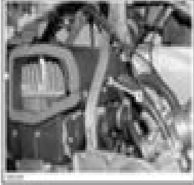
1. 8 and 9