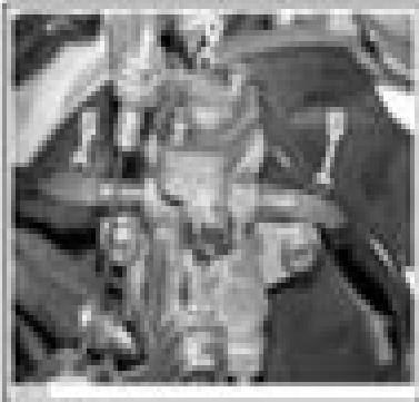
1. 4 and 5 2. 4 and 5

Insert a small hose pincher (P/N 100-008-010) at the inlet at line and disconnect it from oil pump. Catch any leakage.