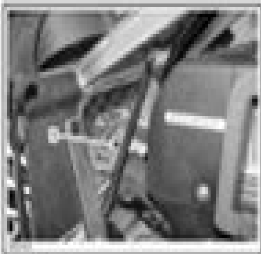
1. 8 and 9