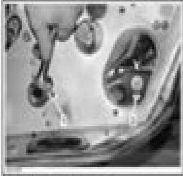
1. 4 and 5 2. 4 and 5

Unloosen engine support bolts nos. 4 and no. 5.