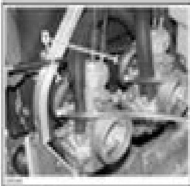
1. 4 and 5

Unloosen valvetrain clamps nos. 8 then separate the valvetrain nos. 7 from the engine.