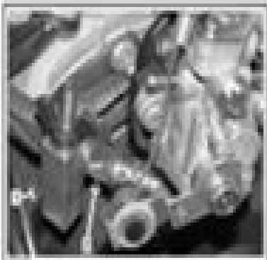
1. 4 and 5 2. 4 and 5

Unloosen engine support bolts nos. 4 and no. 5.