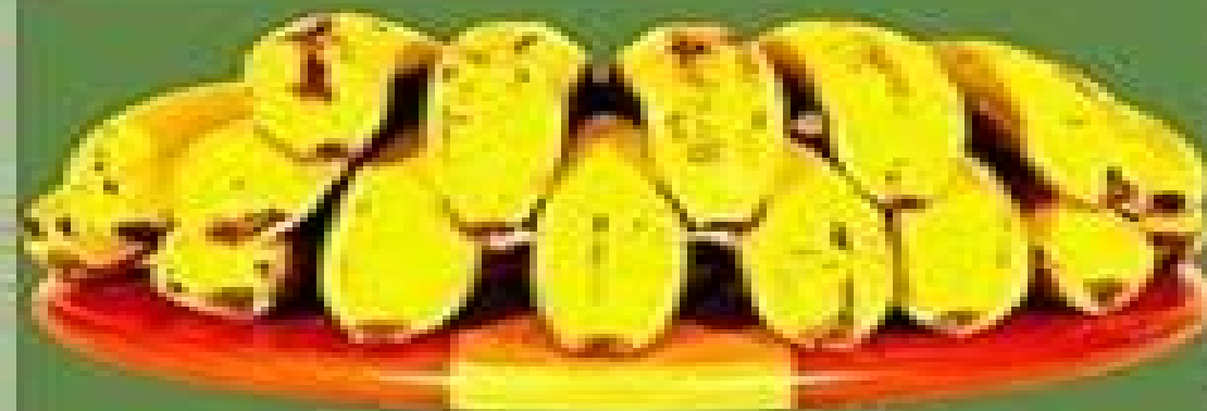
Banana-ganizer! See Page 40