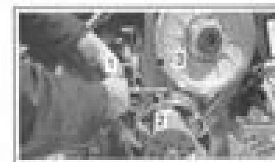
Illustration: FIG. 7 1. Upper O-ring - flat 2. Bottom O-ring - deflected 3. Reference rule