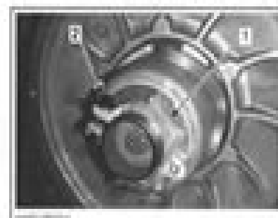
Illustration: FIG. 2 1. Clamping screw 2. Suspension adjustment tool