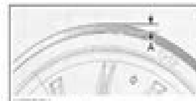
Illustration: FIG. 4 1. Clamping screw 2. Suspension adjustment tool

NOTE: The adjustment ring has left hand threads. Repeat step 5 until the external surface of drive belt exceeds driven pulley edge by 5mm to 2 mm (5/16 in to 3/16 in).