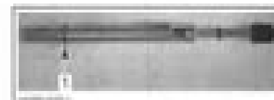
Illustration: FIG. 5 1. Bottom O-ring