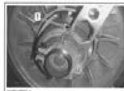
Illustration: FIG. 3 1. Suspension adjustment tool

NOTE: The adjustment ring has left hand threads. Repeat step 5 until the external surface of drive belt exceeds driven pulley edge by 5mm to 2 mm (5/16 in to 3/16 in).