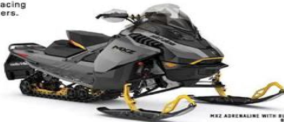
MXZ ADRENALINE WITH BLIZZARD PACKAGE 850 E-TEC SHOWN

High-tech features and racing DNA for hardcore trail riders.