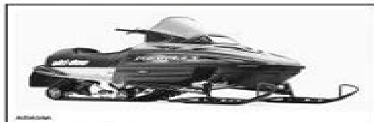
TYPICAL — S-SERIES