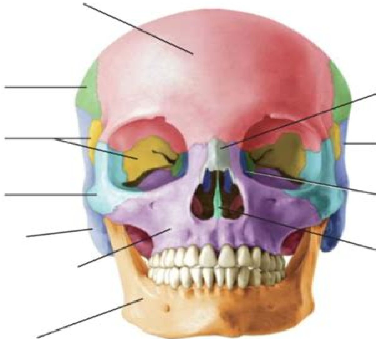
B. Front view