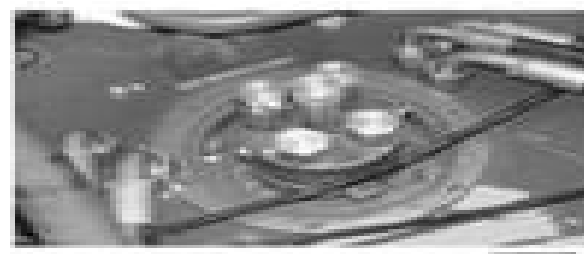
Figure 1 Removal, hydraulic hoses