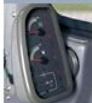
Instrument panel can be angled