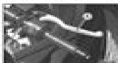
A. Proper Braking Lean

Warning: It is better to avoid braking to the right application of both brakes or not to brake at all. Reduce your speed before you get into the corner. For emergency braking, disengage the clutch, and concentrate on applying the brakes as hard as possible without skipping.