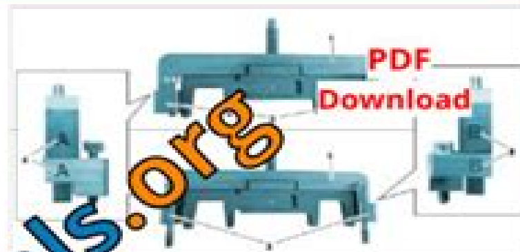
Fig. 2c: Identifying Linkage Tool P779 Position

2.1. Secure in and tighten two bearing screws -2- head-right.