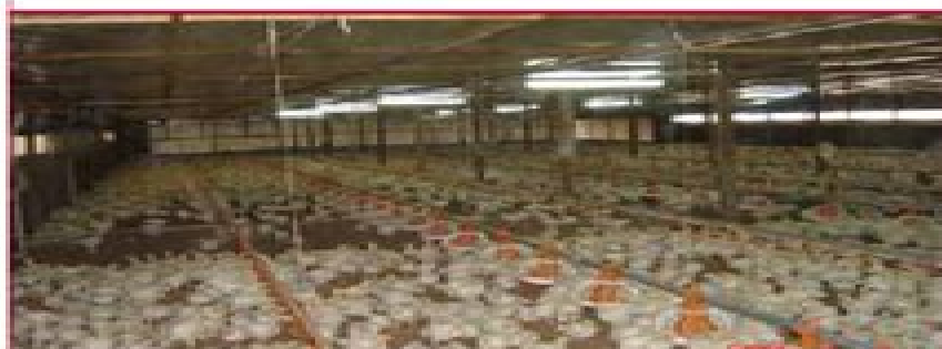
Figure 1 Large-scale broiler operations