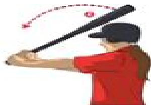
Heavy Bat Snaps 2 sets x 15 seconds

Hold a heavy bat straight out in front of body. Slowly bring barrel to forehead, then snap back to starting position.