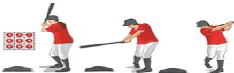
Windshield Wipers 2 sets x 9 swings

Hold a heavy bat straight out front, with barrel pointing to sky. Rotate the bat to the right like a windshield wiper, then back to top. Repeat. Switch direction each set.