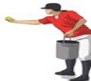
Location Soft Toss 5 minutes

Partner stands 10 feet away at a 45° angle. Partner soft-tosses pitches to Batter in various locations, trying to hit the same 9 contact points.