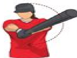
Heavy Bat Rotations 4 sets x 15 seconds

Hold a heavy bat straight out in front of body. Slowly bring barrel to forehead, then snap back to starting position.