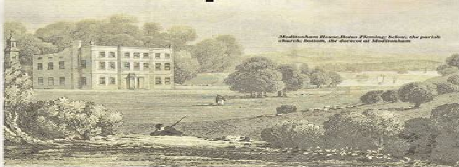
Moditonham House. Below: Fleming; below, the parish church; below, the church of Moditonham.