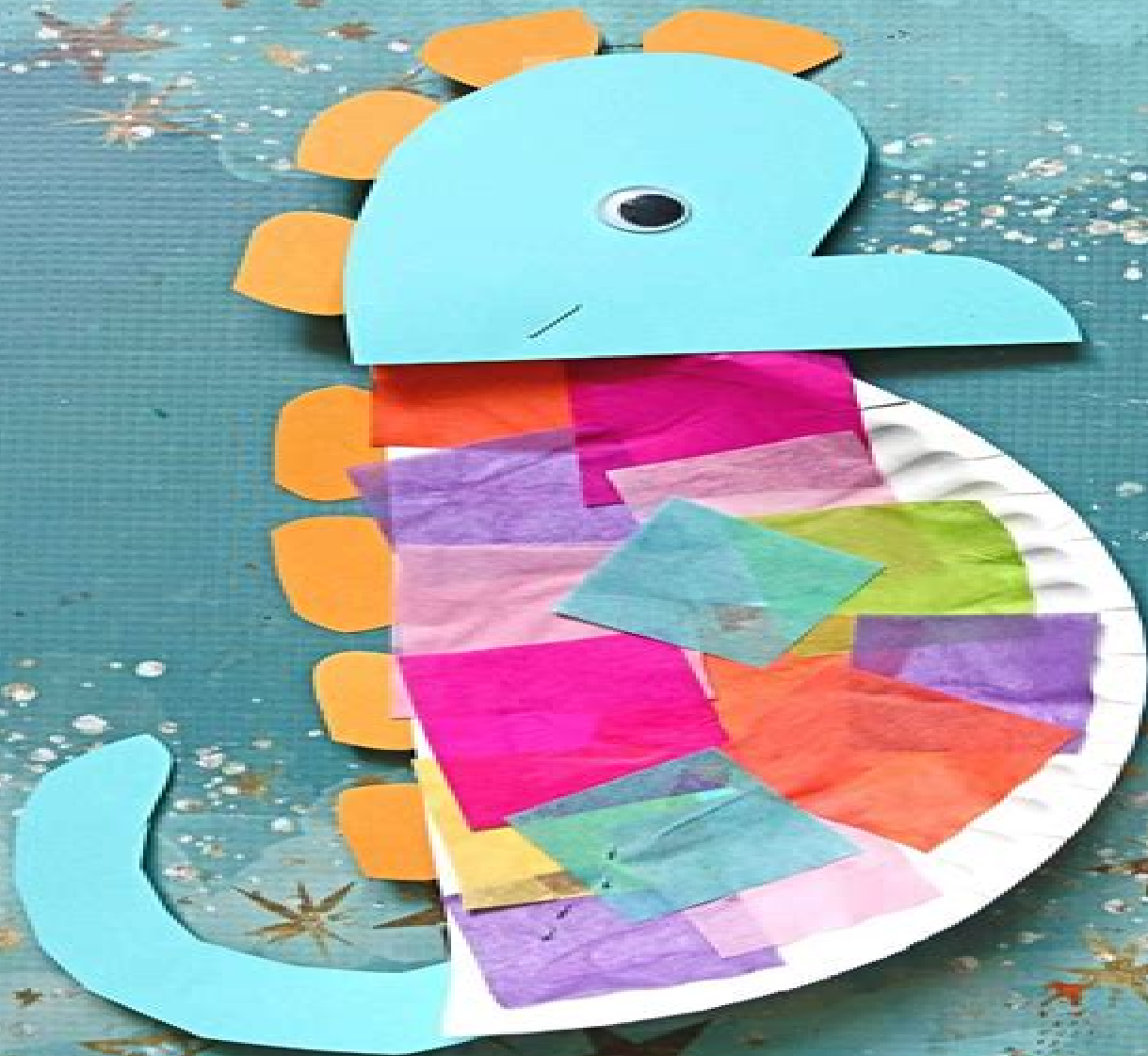
PAPER PLATE SEAHORSE