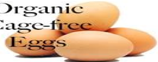
Organic Cage-free Eggs