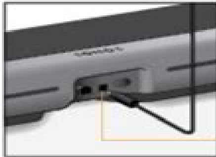
PLAYBAR'S Digital Audio In

Be sure to remove the protective caps from each end of the optical audio cable before inserting.